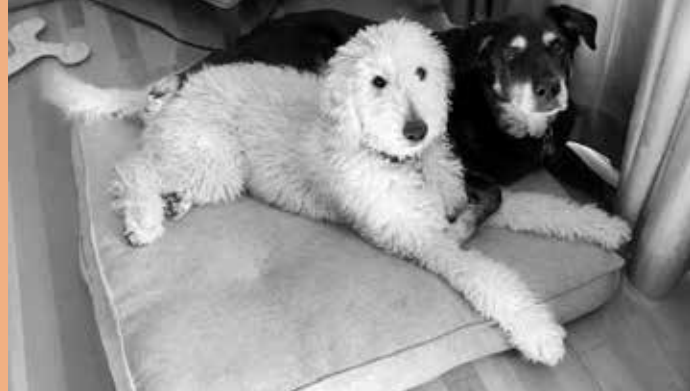
LUNA & OLIVE