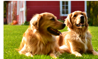
Horizontal shots like this!