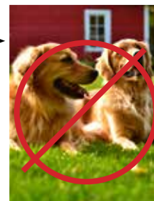
NOT like this... this is vertical!