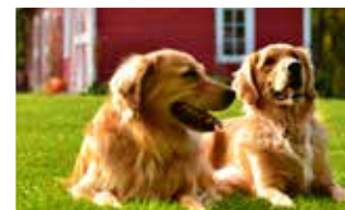
Horizontal shots like this!