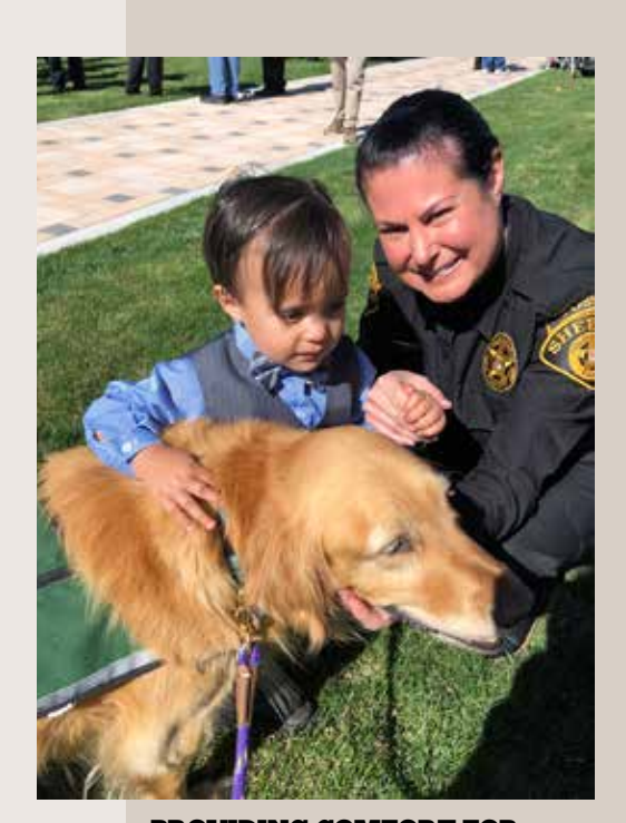
PROVIDING COMFORT FOR OUR PEACE OFFICERS AND THEIR FAMILIES

-Light up the Dark Teen Suicide Prevention Event