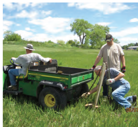
Work Day at Phoebe's Place 2013