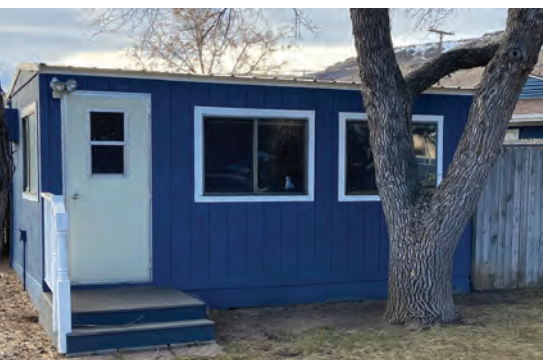
The original Hut at Sage Valley