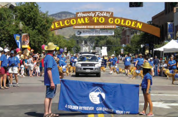
Buffalo Bill Days Parade

The best day of the year, our Annual Reunion Picnic, started back when we were smaller in 1997. We gathered at Lyons Park in Golden; it was beautiful there with a pond for the dogs to play in. It was also the start of the infamous Great Ball Toss! It was more of a carnival with some silent auction items, a lot of wonderful food, and like it still is today, lots of very happy Golden Retrievers having fun with their new people and the