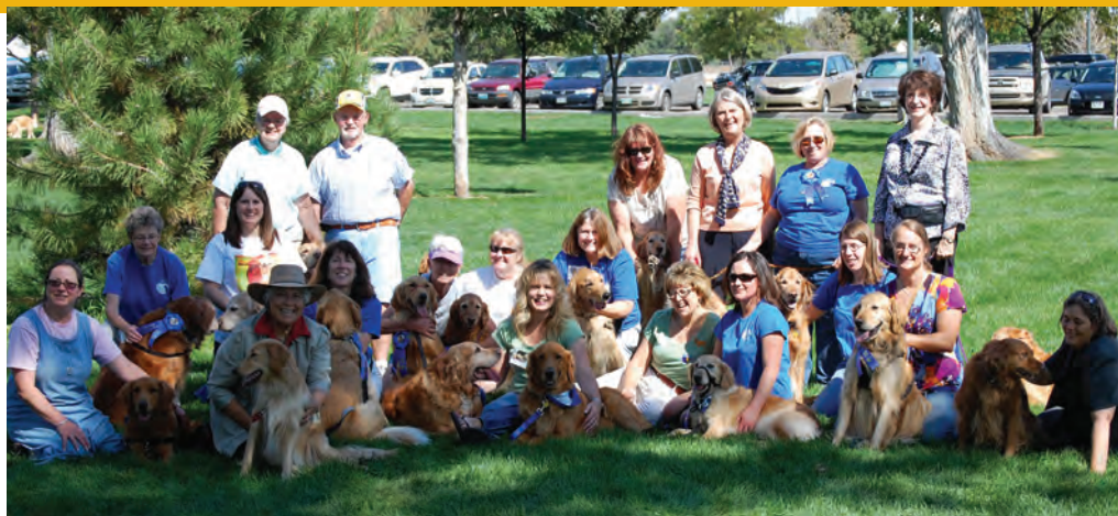
Golden Retriever Nationals Rescue Parade participants in Greeley 2010

"Goldens in Golden" 2013 - over 1000 happy Goldens and their people!