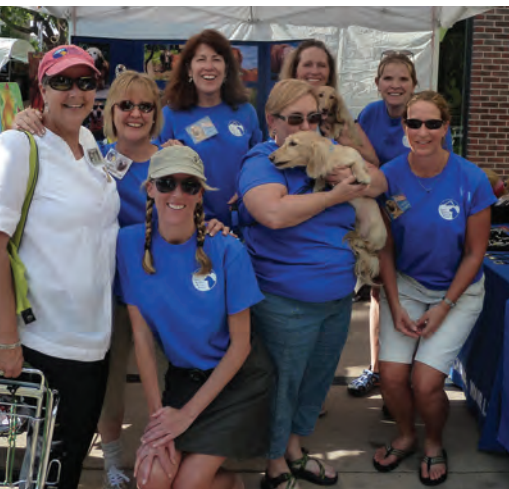
Cherry Creek Art Fest booth

always asked at any event: "Who would ever give up a Golden Retriever?" and "Why would you need a Rescue for Golden Retrievers?" Getting awareness out there for GRRR was a big thing and we were very fortunate to have so many volunteers willing to do events, including TV appearances on Petline 9 where we proudly wore our GRRR t-shirts and our Golden Retrievers proudly wore their "begging vests" to help support GRRR.