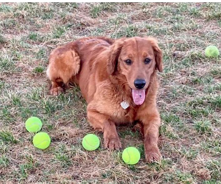
Millie is ready to play!

Although Rex spends a lot of time sniffing the plants when we walk, Millie is all about the sights. No matter where we walk, she will stop and scan the horizon, just taking it all in. One day I pulled in my driveway and opened the hatch to get the dogs out. Millie would not budge. Fortunately, it was a cool day, so I let Rex inside the house and went into the back of the car with Millie. I