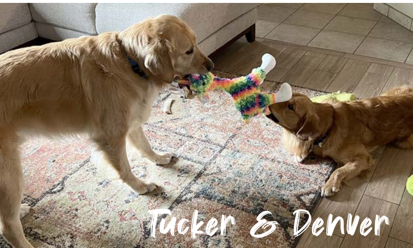
Tucker & Denver