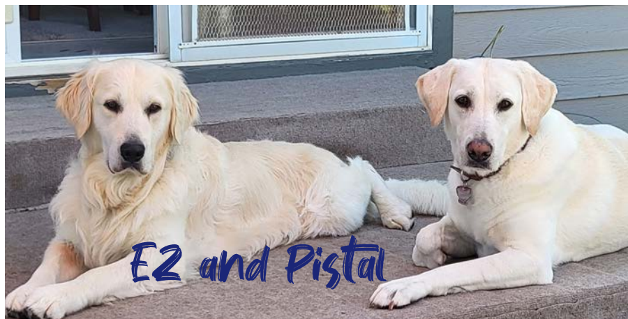
EZ and Pystal