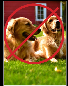
NOT like this... this is vertical!