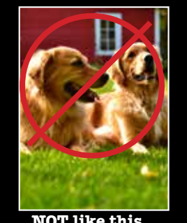
NOT like this... this is vertical!