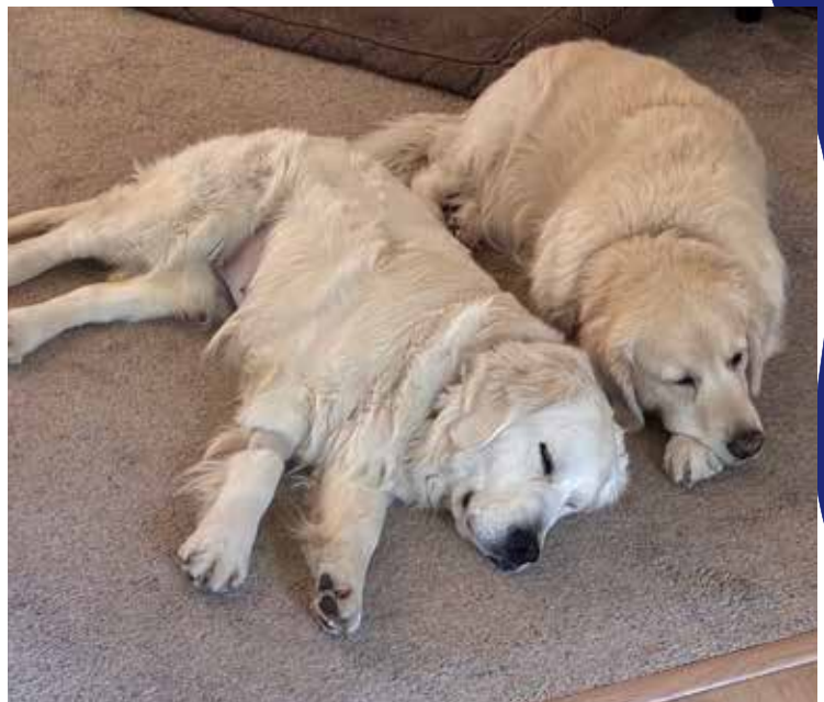
Max & Marney

In the following days, repeating the van drill, Marney no longer hesitated on the steps (another achievement) and hopped right in. Our contribution to her comfort was keeping that soft toy IN the minivan, which she promptly grabbed like an emotional support prop.