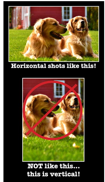
Horizontal shots like this!